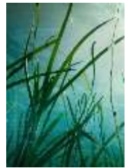
Eelgrass in Kertinge Nor