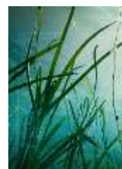
Eelgrass in Kertinge Nor