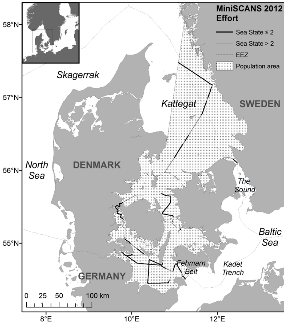
Figure 1 Map of survey area showing effort in Beaufort Sea State \leq 2 (black line) and Sea State > 2 (grey line, not used for the analysis in this report). The shaded area indicates the area for which the abundance estimates of the harbour porpoise Belt Sea Population were calculated.

The survey transect design was replicated from the SCANS-II survey in 2005 (SCANS-II 2008) and designed to provide equal coverage probability. The survey was conducted on board RV Skagerak, a research vessel owned by Gothenburg University. This ship was also used during SCANS-II and proved very suitable due to low noise emission and two separated observation platforms (Fig. 2). RV Skagerak was kept at a constant speed of 9-10 knots. The Danish ship Gunnar Thorsen was used in 1994, but there is no reason to believe that differences between the two ships used over the years should affect the results.