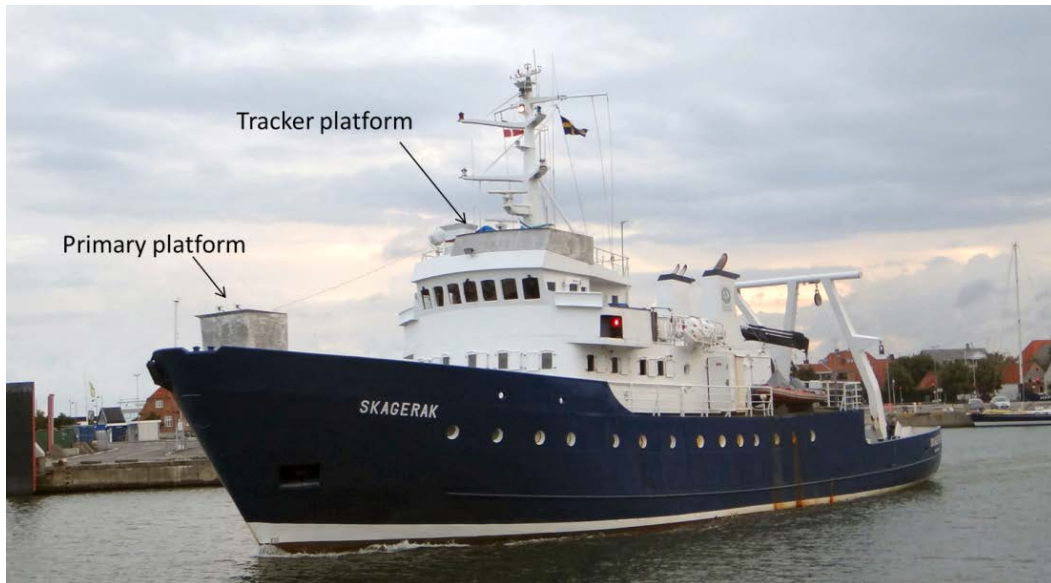
Figure 2 The research vessel "Skagerak" used for the survey with the two observation platforms indicated.

The survey method adopted was double platform line transect survey with two teams of observers: a primary team (two people at a time) on the foredeck (6 m above sea surface) and a tracker team (four people at a time) on top of the Bridge (10 m above sea surface). By using two observation platforms, abundance estimates can be generated that are corrected for animals missed on the transect line and for the effects of animals moving in response to the ship (Buckland et al. 2001, Laake & Borchers, 2004).